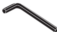
2mm allen key