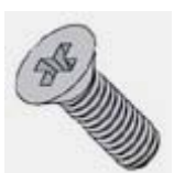
9 x screws M3x12 7991DIN