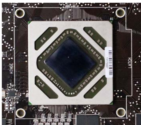
Tahiti XT / Pro GPU e.g. Radeon HD 7970/7950

Apply thermal compound on the top of the copper adapter plate as well!