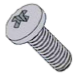
1 × screw M3x6 DIN7985